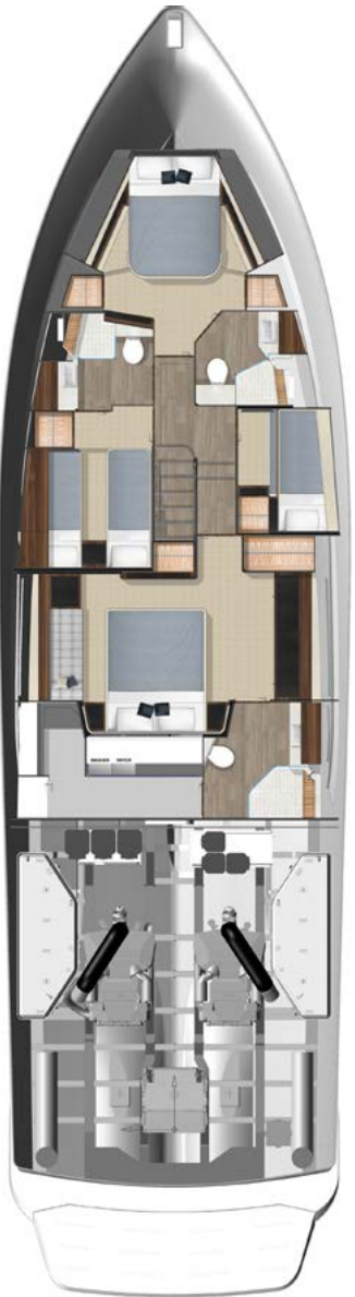
Utility Room design (standard)