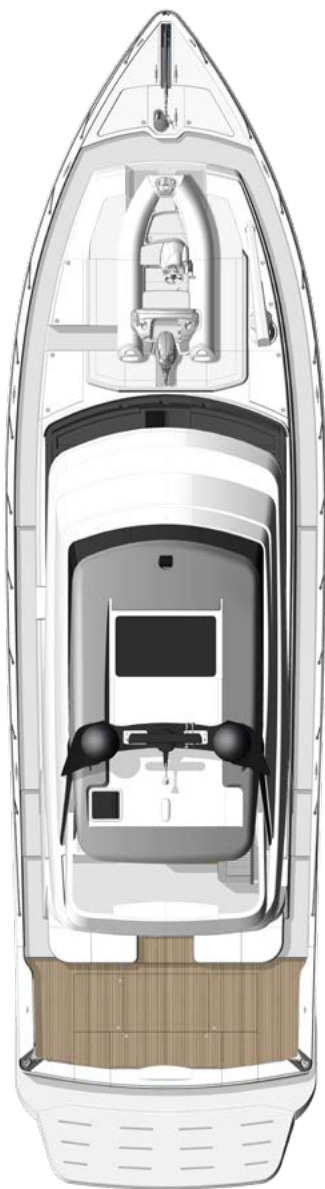
Tender and Davit (option)