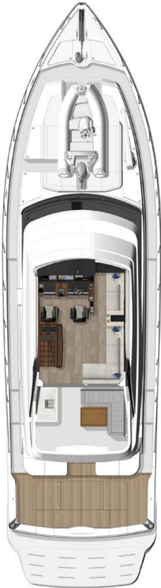
Teak Cockpit Floor (option)