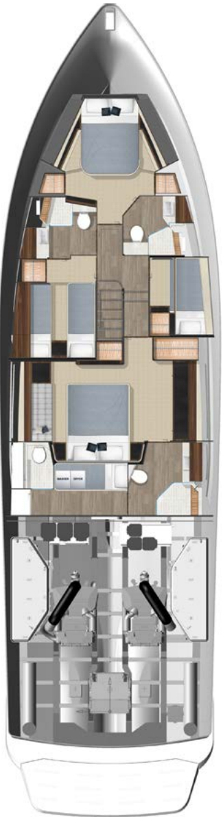
Crew design (option)