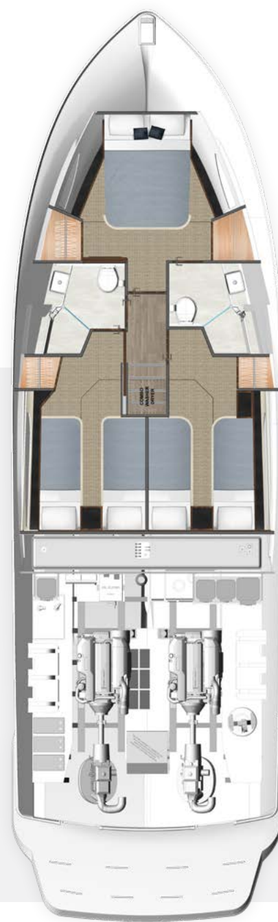
ACCOMMODATION DECK Shown with optional twin beds to Port