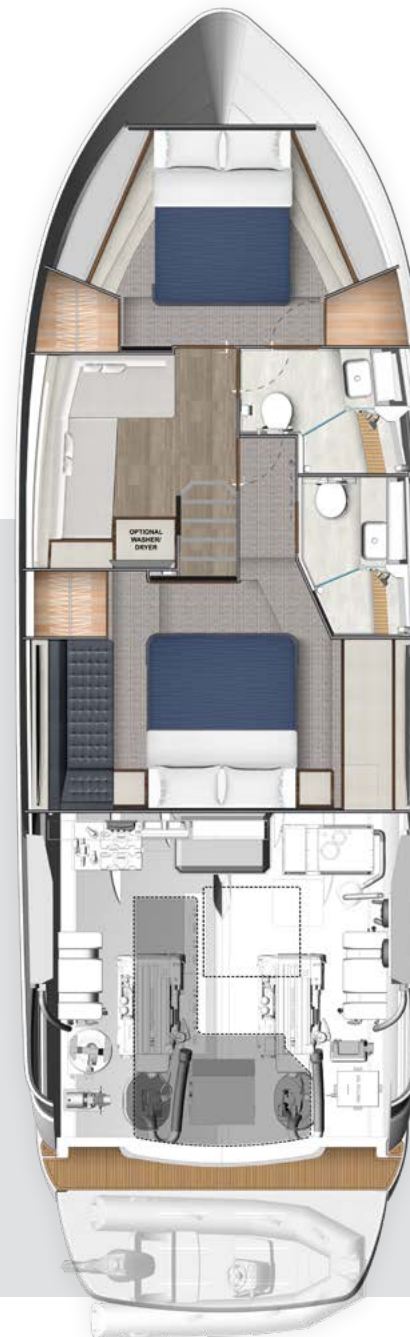
ACCOMMODATION DECK Shown with optional washer/dryer