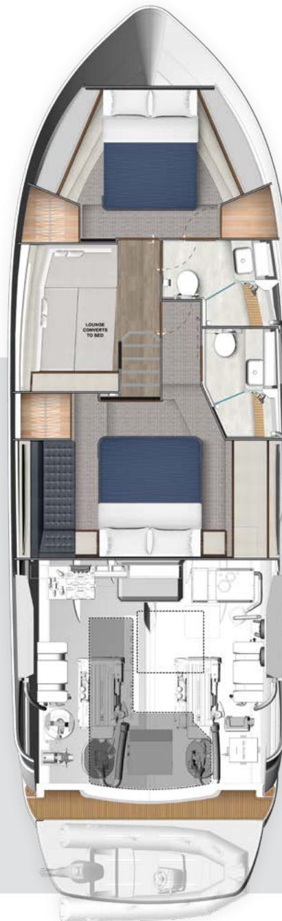
ACCOMMODATION DECK Shown with optional fold out bed